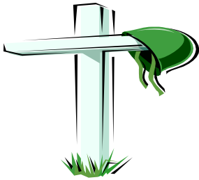
Remembering our vets.

For the third year, plans are under way to honor veterans in our Central Family and veterans among our friends and families. The special service is set for 9:30 a.m. Sunday, Nov. 9.